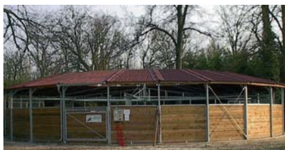
Doumen Racing Stables, Lamorlaye, France. Partial roof with corrugated bitumen roof