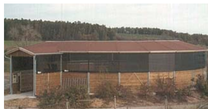
Phillip Retirement Stables, Neuhausen, Germany. Partial roof with corrugated bitumen roof, covered entry and wind net