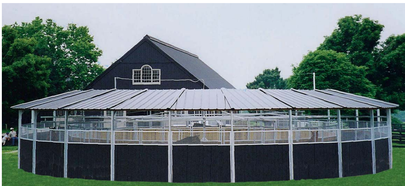
Overbrook-Farm, Lexington, Kentucky (USA). Partial metal roof

Uwe Kraft Reitsportgeräte & Metallbau GmbH