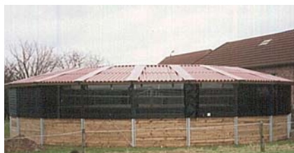
Bartolini Racing Stables, Mortroux, Belgium. Partial roof with corrugated concrete fiber roof