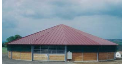
Spanish Riding School, Vienna, Austria, Ceiling Mounted Walker with metal roof and wind net