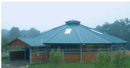
Fairhill Training Center, Oxford, Maryland, USA, Ceiling Mounted Walker with metal roof