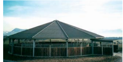
Paul Estermann Riding Sport Center, Hildisrieden, Switzerland, Ceiling Mounted Walker with corrugated cement fiber roof