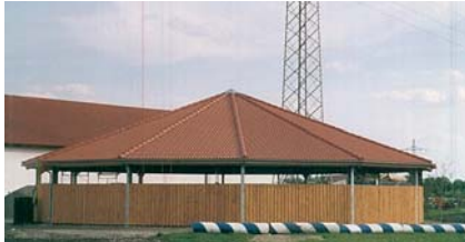
Frenzl Riding Stables, Munich, Germany, Ceiling Mounted Walker with ceramic tile roof