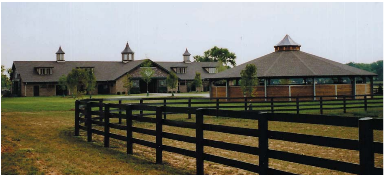
WINSTAR-Farm, Lexington, Kentucky, USA, Ceiling Mounted Walker with shingles

Uwe Kraft Reitsportgeräte & Metallbau GmbH