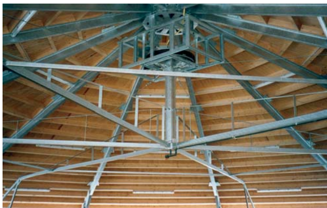
Ceiling Mounted Walker, round, open inner area for lunging